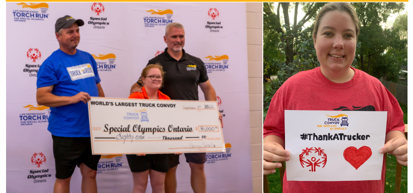
Together we raised over $81,000 for Special Olympics Ontario in 2022 through our epic truck ride adventure!

The trucking industry, Truck Ride and the LETR, has helped make it possible for Special Olympics to reach more communities and more people with an ID across Ontario.